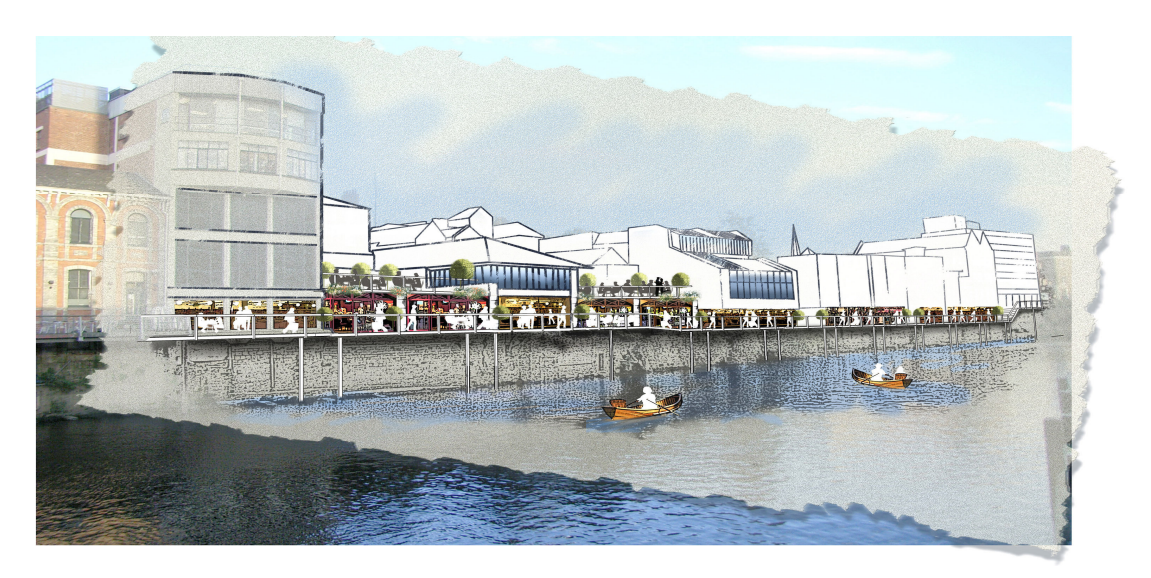
...should it be extended further towards Ouse Bridge ?