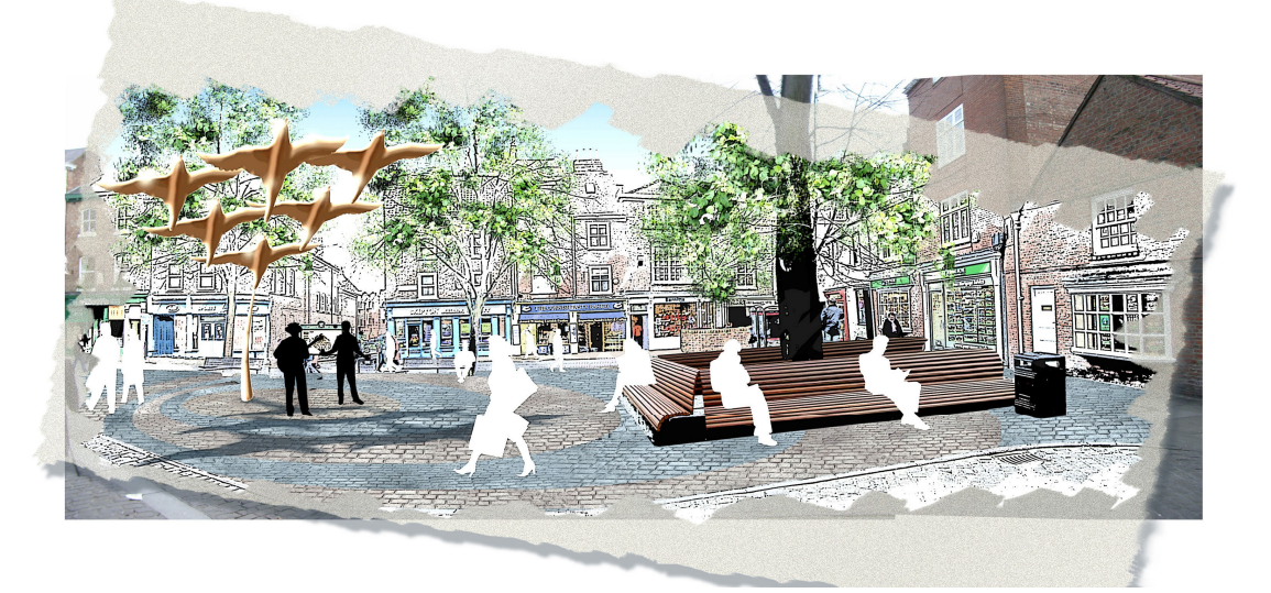
Would Kings Square, and other public squares in the centre, benefit from de-cluttering and re-design ?

These include public squares, like St. Sampson's Square and Kings Square, as well as streets and snickleways between them. The Action Plan will look at ways to make better use of them, improve their quality and see how they can help define key tourist and shopping circuits. Better interpretation of the historic environment is suggested, together with high quality lighting and seating, public art and improved security and accessibility.