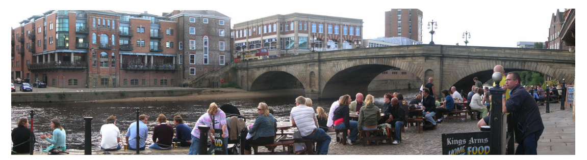
New city centre apartments overlooking the Ouse

As well as being the focus for retail and business activity, the city centre is also the cultural and community heart of York. It serves people from the wider York community as well as city centre residents and people working, shopping and relaxing.