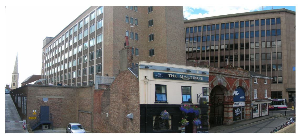
Office development, Rougier Street

York has the second largest earnings growth rate in the country and, with over 30,000 jobs, the city centre plays a critical role in that competitiveness and attractiveness. It is a vibrant city with a strong retail presence and over 4 million visitors a year. The evening economy and diversity of attractions are changing, and the Action Plan asks questions about how this should take shape, as well as how we should look at new office and retail development opportunities. It also asks what improvements are needed to help manage traffic congestion and build on the importance already given to pedestrians and cyclists.