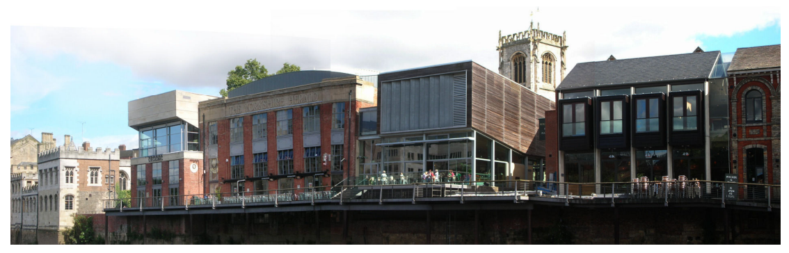
The boardwalk and recent regeneration along the Ouse riverside, at the rear of Coney Street.

The city centre tends to turn its back on the rivers in places and does not really maximise their potential. Access is restricted and there is a shortage of vibrant riverside public spaces, as well as quality areas for contemplation and relaxation. Through this Action Plan we will look at the potential to extend walkways, open up under used areas, and provide the right conditions to redevelop poorer quality buildings and spaces.