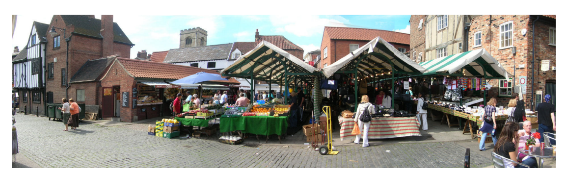
Can more be made out of the Newgate market area ?