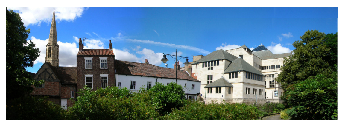
Old and new residential and office development on the north side of the Ouse

It will help to ensure that the city centre performs to its full potential in terms of employment and housing, shopping and recreation. It will help to coordinate growth and improvements to the local environment in the right places and at the right times, and to be of benefit to people who live, work in and visit the area.